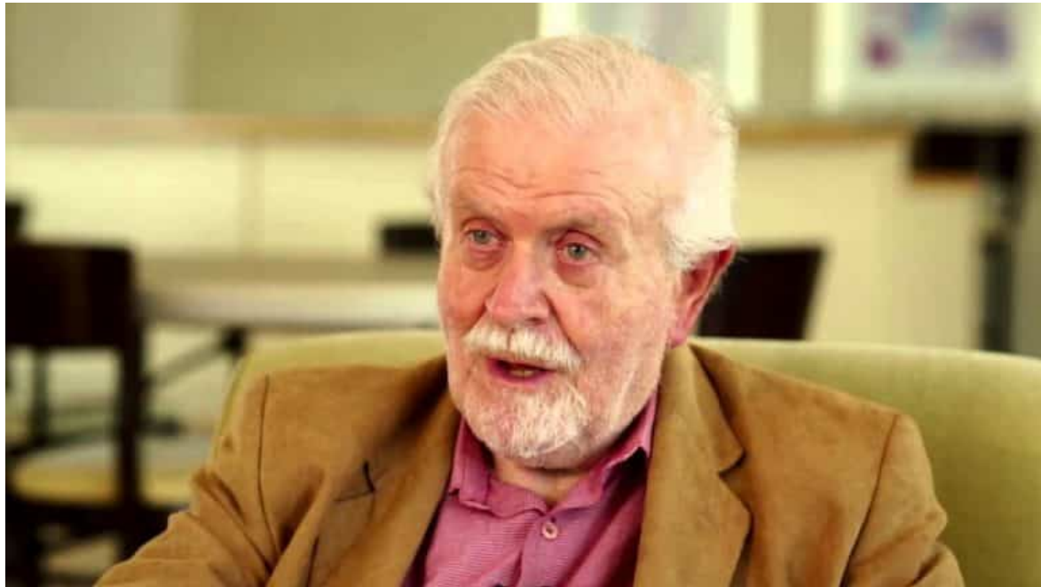
Dr. Fred Singer

Foremost in the struggle to bring essential scientific truths to light on this issue is the Nongovernmental International Panel on Climate Change (NIPCC) founded and directed by the distinguished atmospheric physicist S. Fred Singer. With assistance from climate experts in 16 countries—who donated their time and efforts—the NIPCC produced a massive, extensively-illustrated 880-page report “out of concern that the IPCC was provoking irrational fear of anthropogenic global warming,” in the words of Dr. Singer. The report references 4,000 (!) research papers in peer-reviewed scientific journals that contradict IPCC conclusions but were not used by the IPCC though it claims to be the definitive source of climate research. The entire report can be downloaded free from the Heartland Institute website.